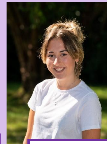
6D Miss Snow