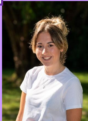
6D Miss Snow